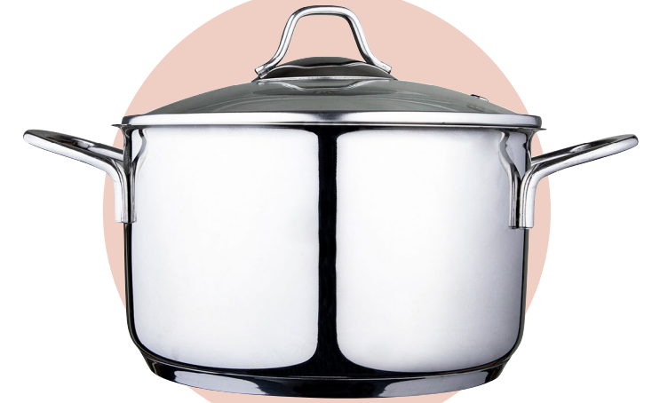
Stock Pot 24cm