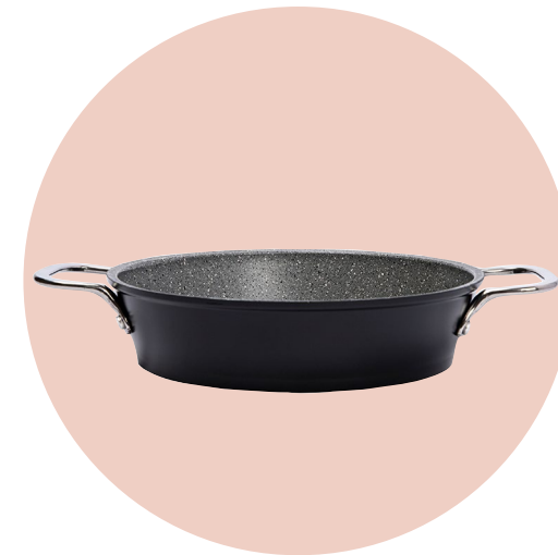
Omelette Pan 20cm