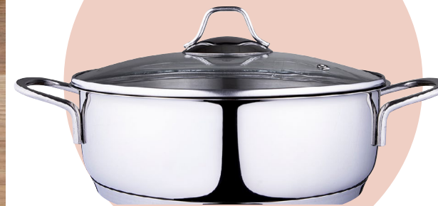
Saute Pan 24cm