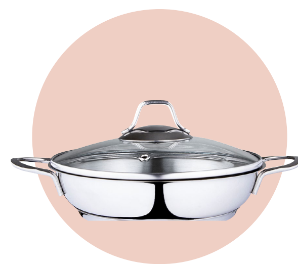
Omelette Pan 20cm