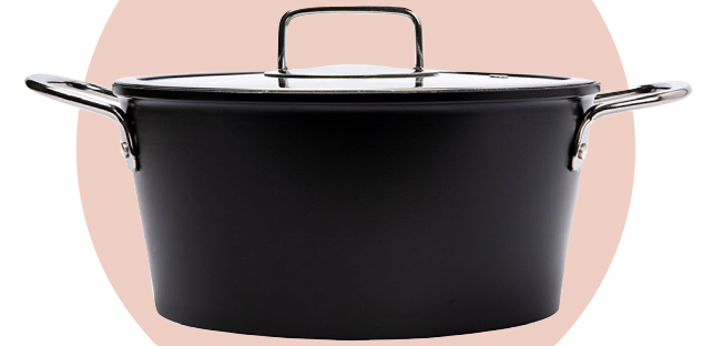
Stock Pot 22cm