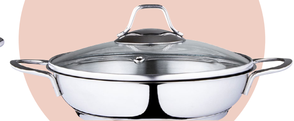
Omelette Pan 20cm