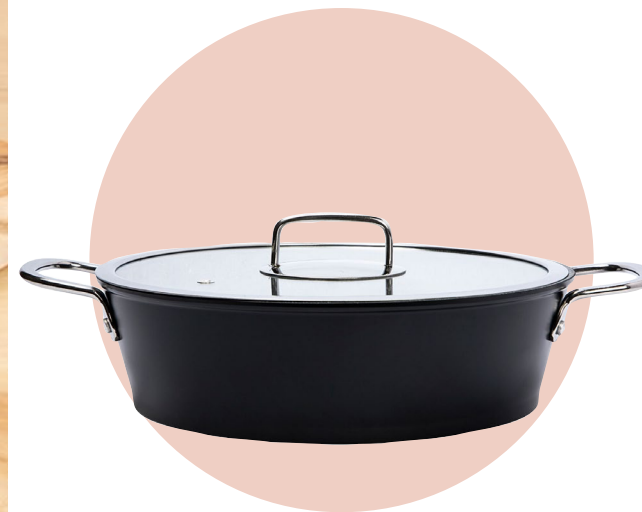
Saute Pan 26cm