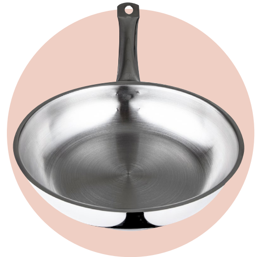
Frying Pan 24cm