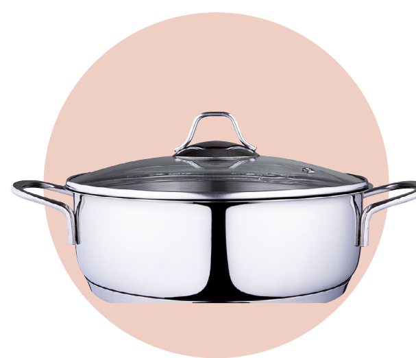
Saute Pan 24cm