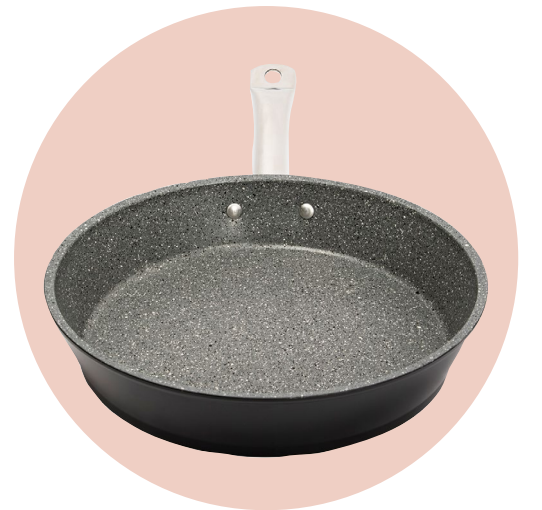
Granite Frying Pan 26cm