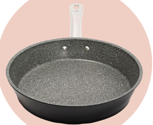
Granite Frying Pan 26cm