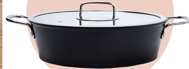
Saute Pan 26cm