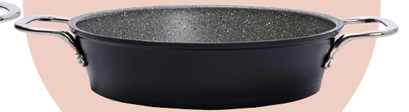
Omelette Pan 20cm